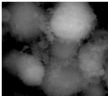
Near Spherical 1-10µm