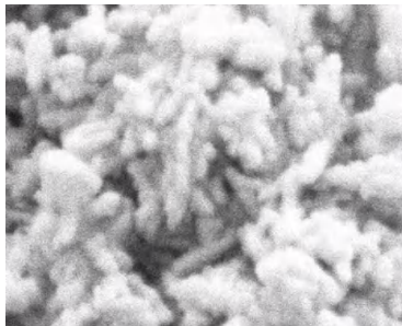
Rod-Shaped 60x150nm avg.